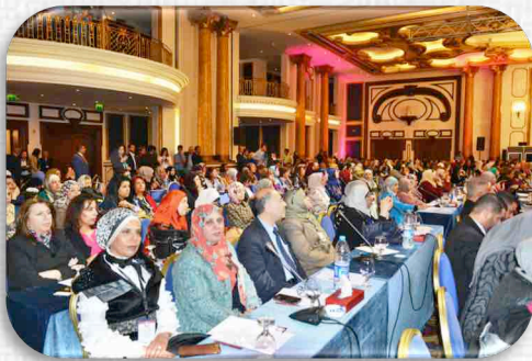
Women's Economic Participation

We randomly distributed book-marks with words of encouragement to the attendees from other civil community entities and NGOs.