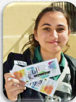
Bookmarks at Fuhais school

We have done the same through another visit to a public secondary school for girls at Fuhais.