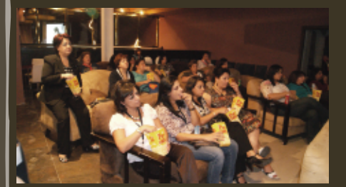
Watching the captain movie